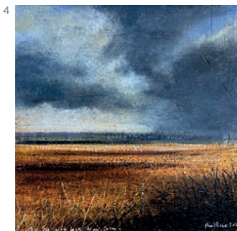
On the way to Coton 20 x 20cm Oil