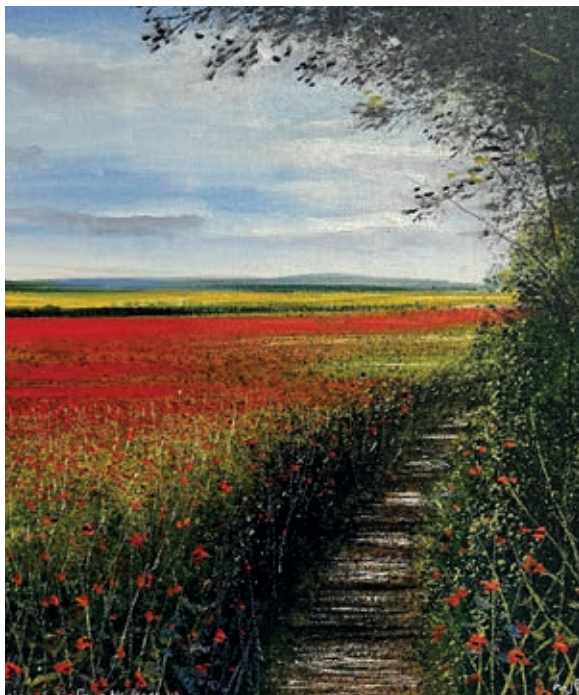
Poppy path 91 x 91cm Oil