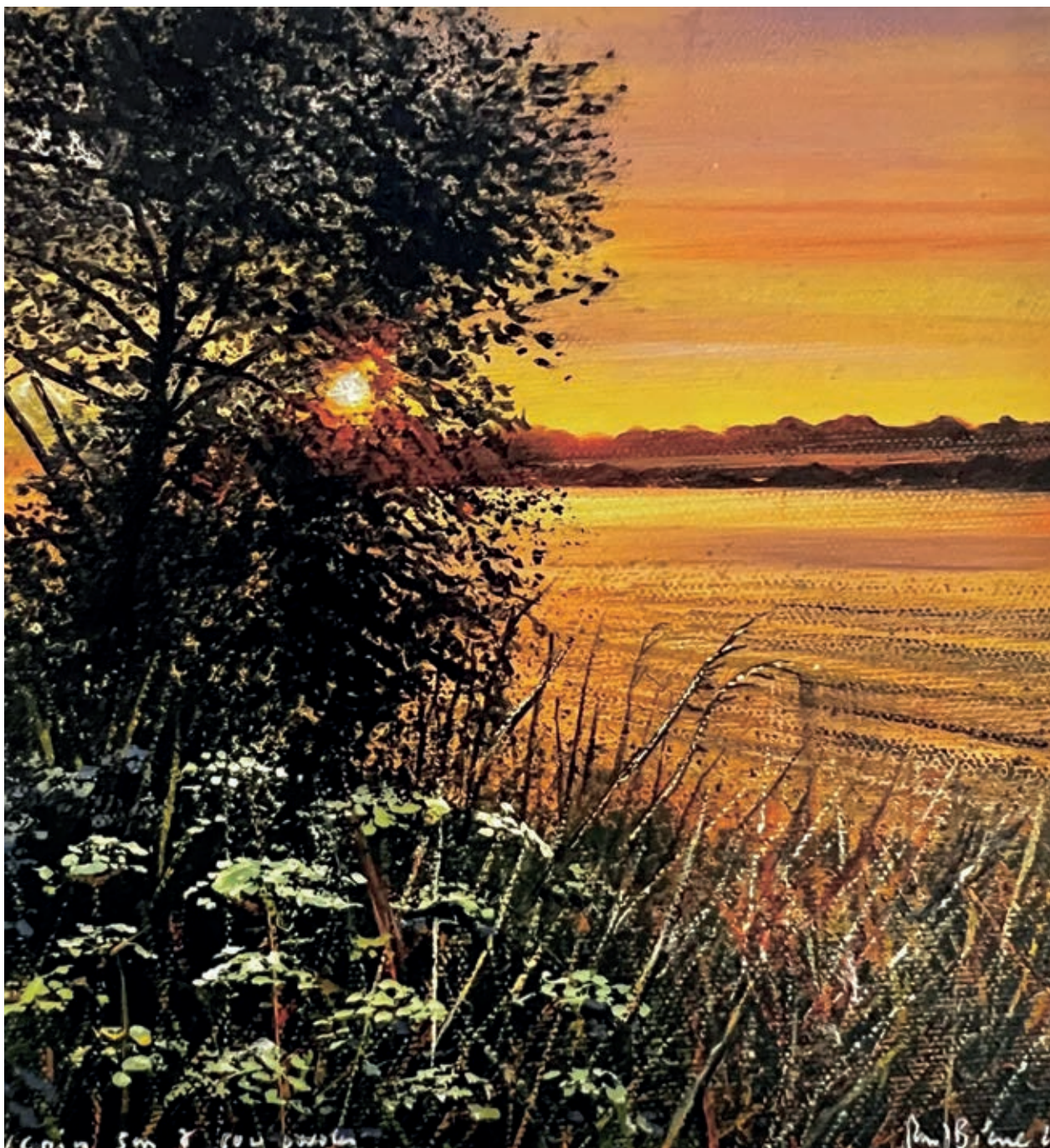
Evening sun and cow parsley 20 x 20cm Oil