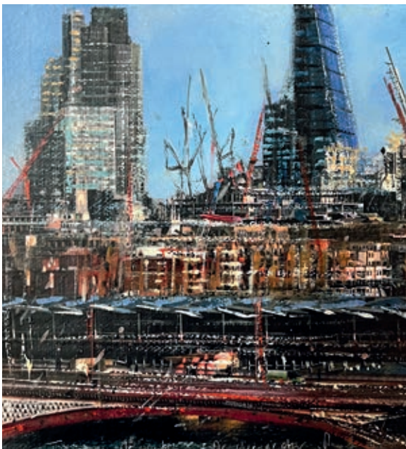
City 15 x 15cm Mixed media