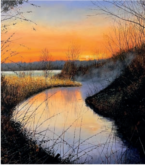
Dawn, River Lea, Psalm 121 122 x 122cm Oil