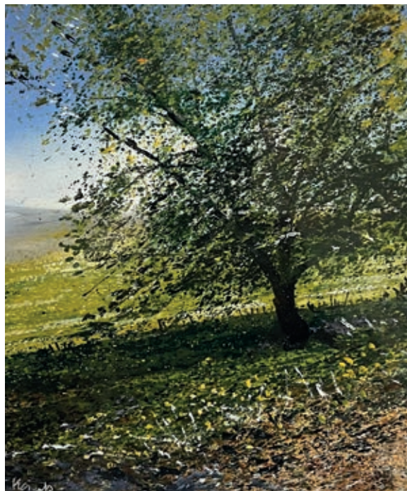
Wild flowers. Golan heights 28 x 21cm Oil