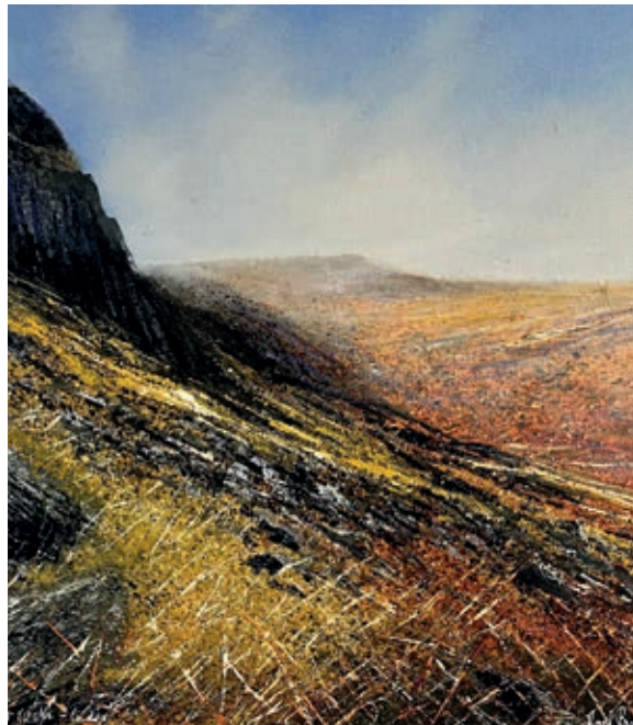
Rocks and mist 30 x 30cm Oil