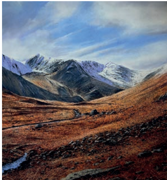
The stone table. Grace. Deepdale 122 x 122cm and 60 x 60cm Oil