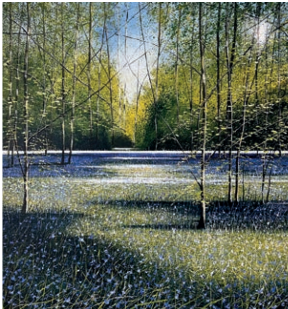
Light and bluebell glade 60 x 60cm and 90 x 90cm Oil