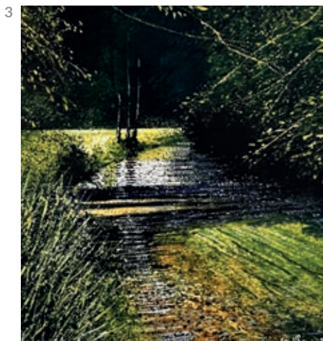
Stream shadows 20 x 20cm Oil