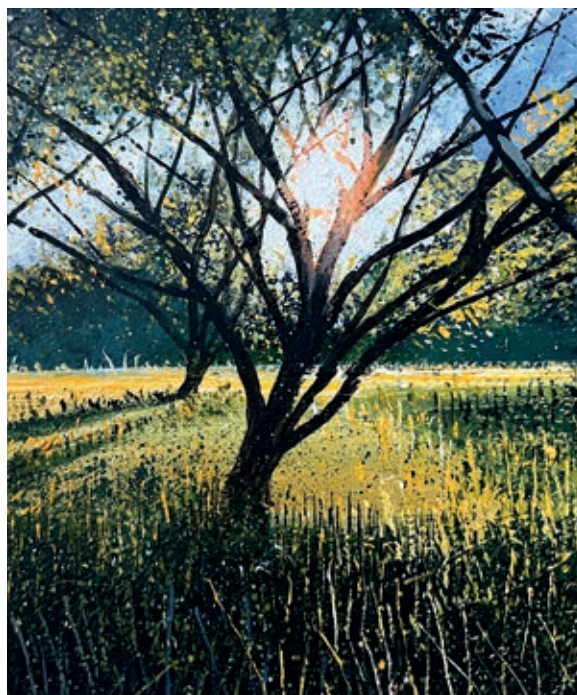
Evening light. The orchard 15 x 15cm Oil