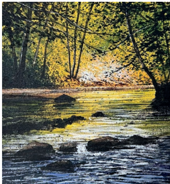
Light. Torver Beck 20 x 20cm Oil