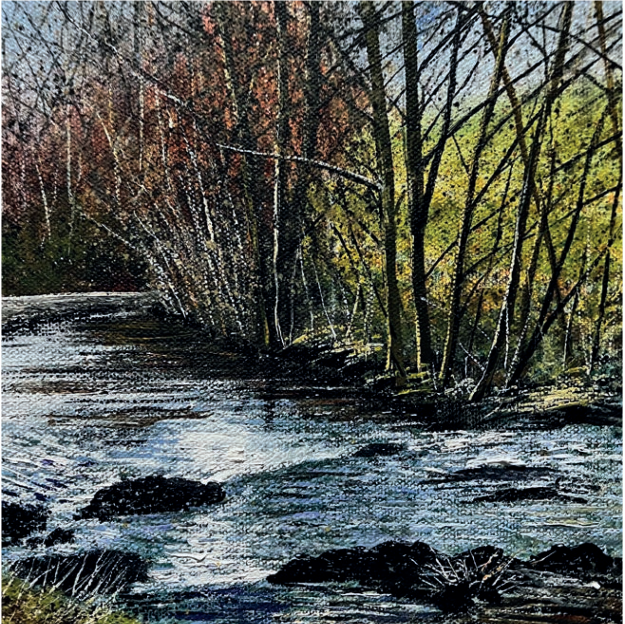
Torver Beck. Sunny Bank Mill 20 x 20cm Oil