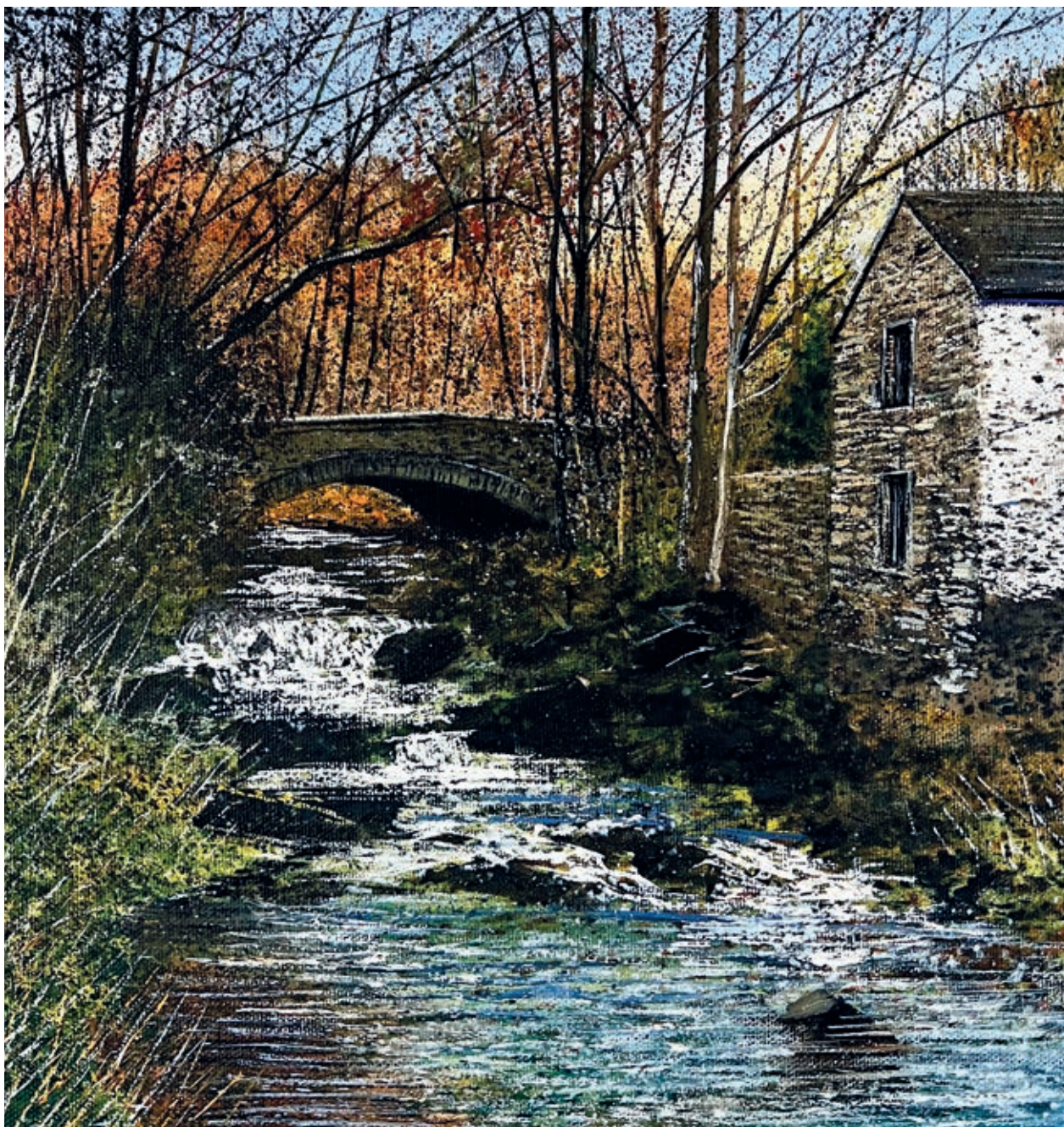
Living waters. Torver Beck from the Mill 30 x 30cm Oil