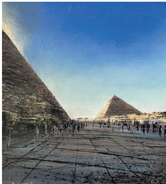
Light over the pyramids 30 x 30cm Oil