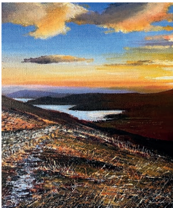
New year. Coming down to Windermere 20 x 20cm Oil