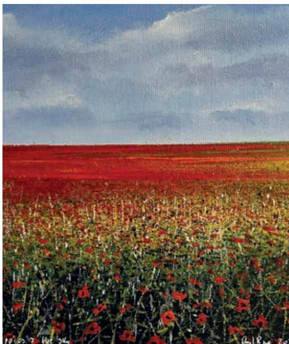
Poppies and blue sky 20 x 20cm Oil