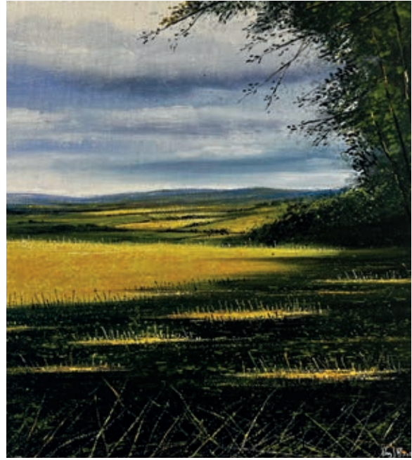
South Downs 30 x 30cm Oil