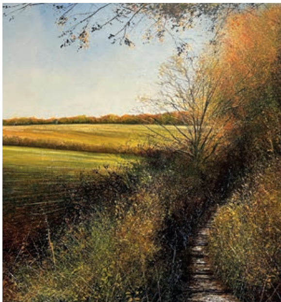
Autumn path 60 x 60cm Oil