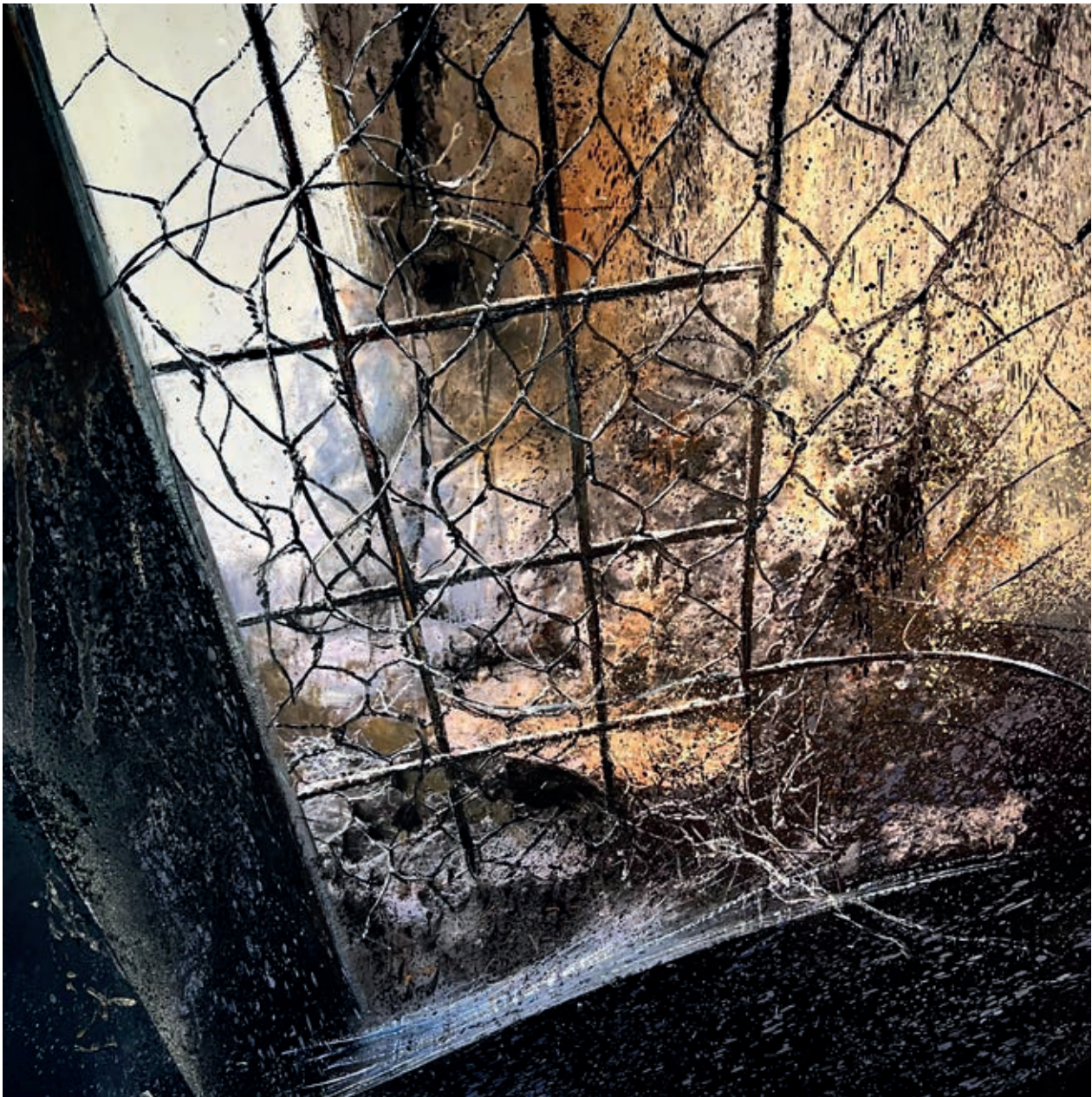
Light through the barn window. Sunny Bank Farm. Freedom. John 8:32 122 x 122 cm Mixed media

'Anyone who drinks this water will soon become thirsty again. But those who drink the water I give will never be thirsty again. It becomes a fresh, bubbling spring within them, giving them eternal life.'