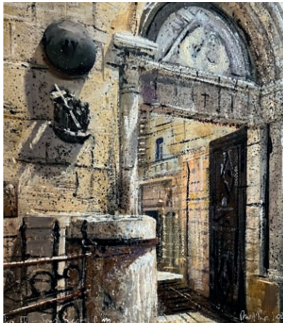
Station four. Jerusalem 20 x 20cm Mixed media