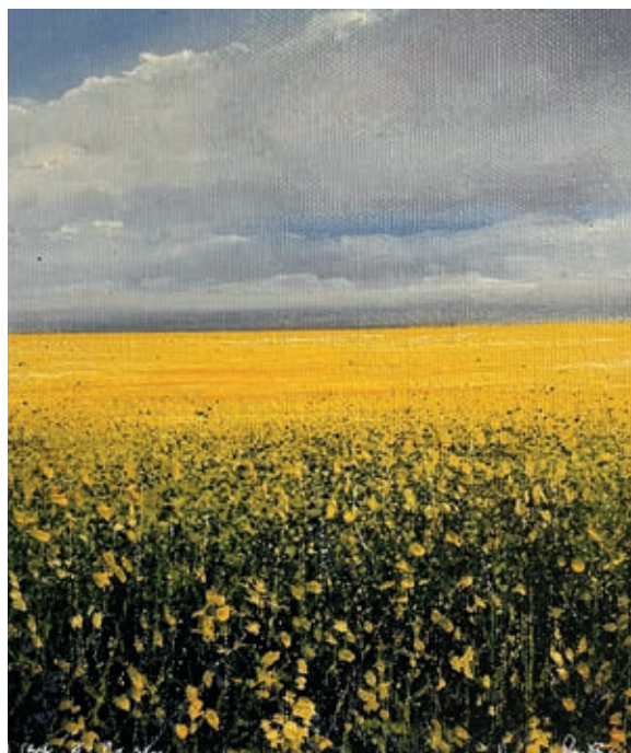
Oilseed rape and blue sky 20 x 20cm Oil