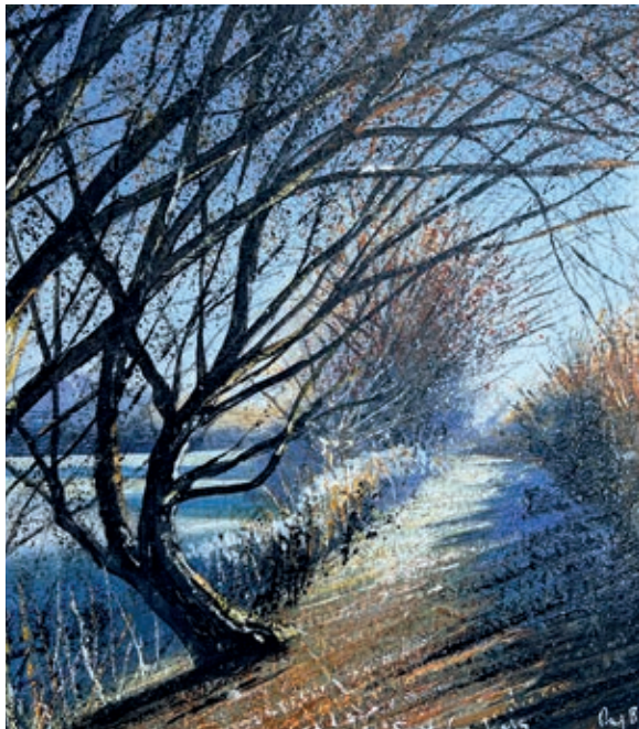
A Maz view. Frost, Lea Valley 20 x 20cm Oil