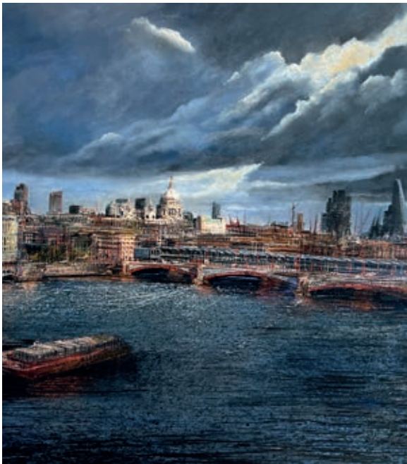
Light on St Paul's 80 x 80cm Oil and mixed media