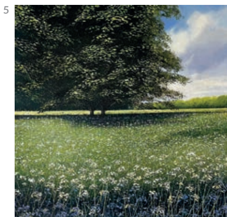
Chestnut trees. We find shelter in the shadow of his wings. Psalm 36:7 91 x 91cm Oil