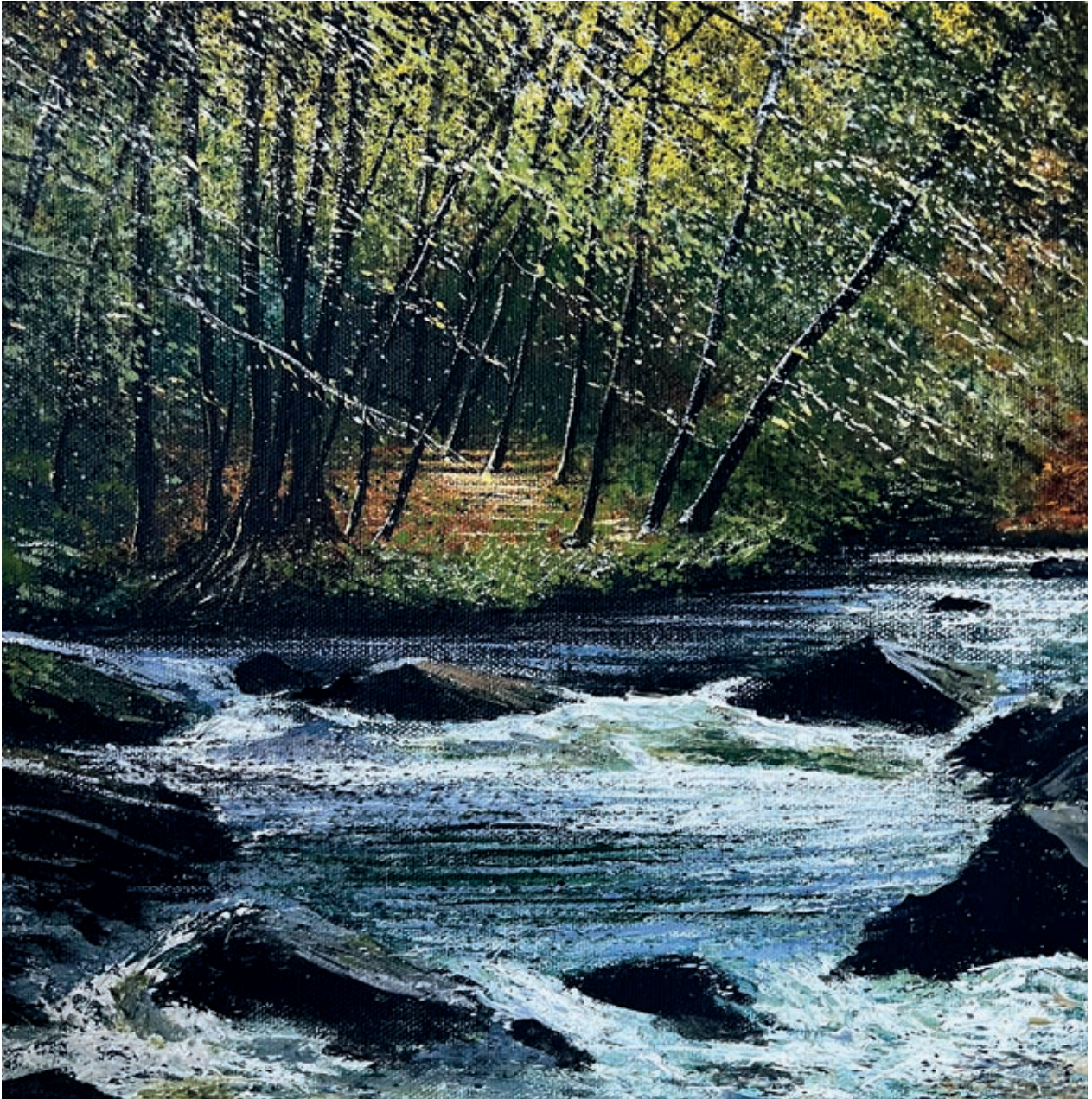
Living waters and woodland glade 30 x 30cm Oil