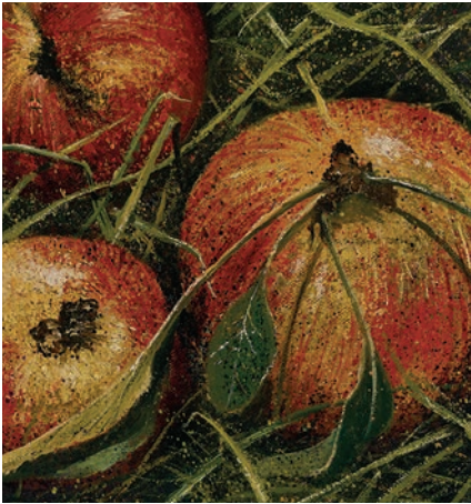
Autumn light Oil 20 x 20cm