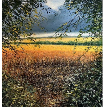
Edge of the wood. Light on the corn. The Oval wood Oil 30 x 30cm