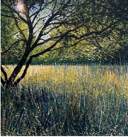
August evening in the orchard Oil 30 x 30cm