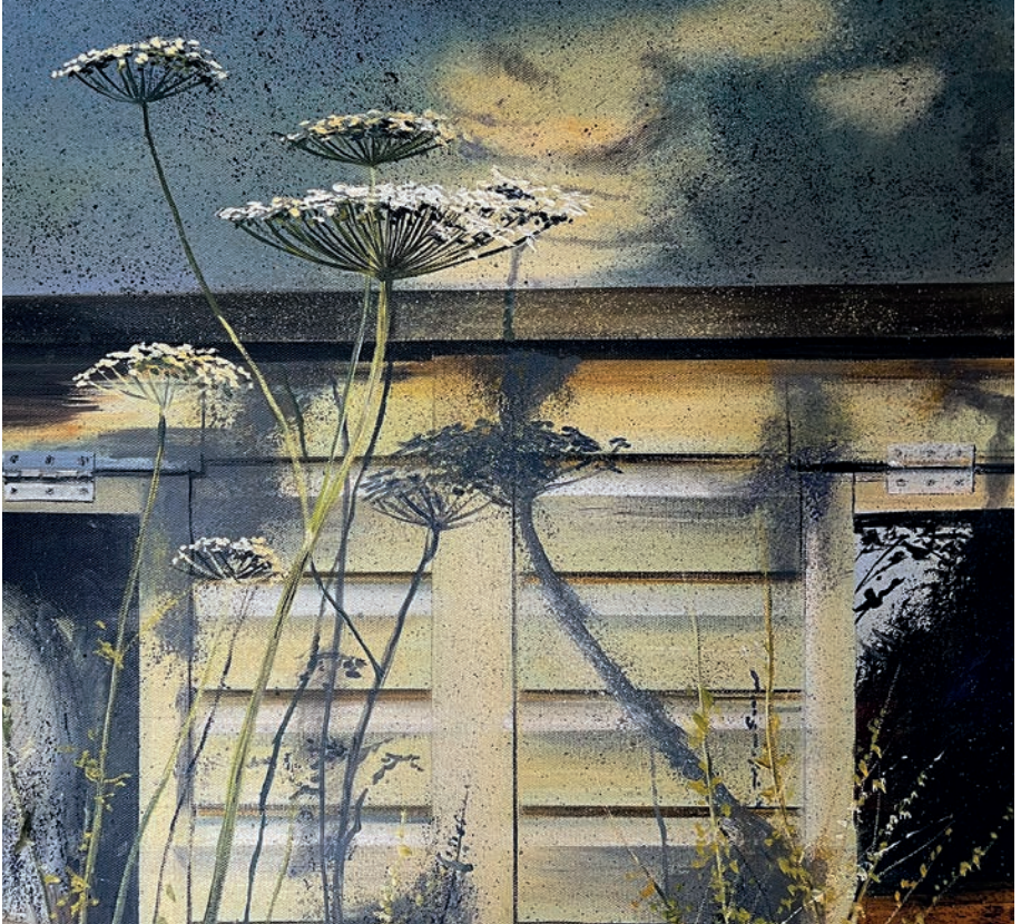
Shadows on the potting shed'. The orchard. The Oval Oil 60 x 60cm