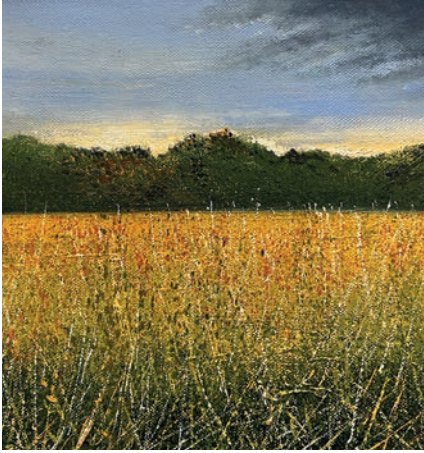
Late summer evening Oil 20 x 20cm