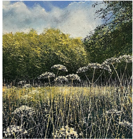
Cow parsley, the orchard Oil 30 x 30cm

“He makes me lie down in green pastures ... He guides me along the right paths for his name’s sake.”