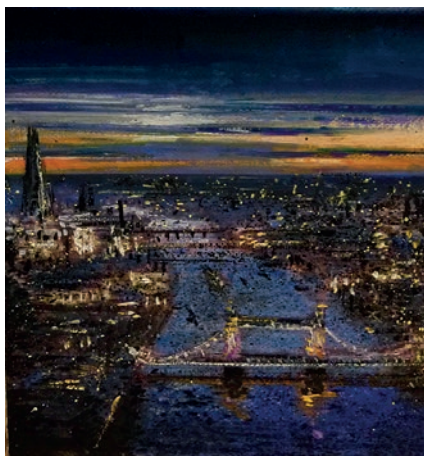
Tower Bridge and the Shard Mixed media 15 x 15cm