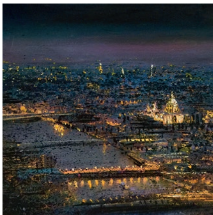
Light of the world Mixed media 15 x 15cm