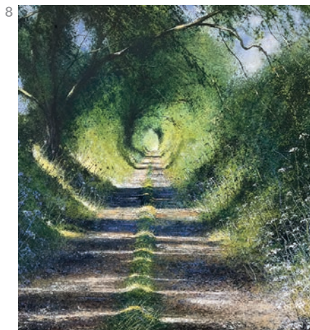
Path and shadows