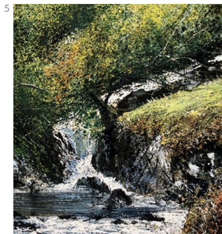
Tree by a stream