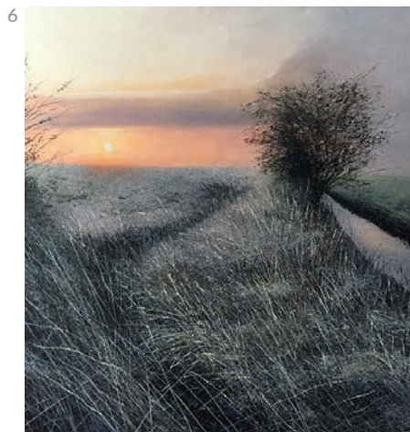
On the way home. Evening light. The fens