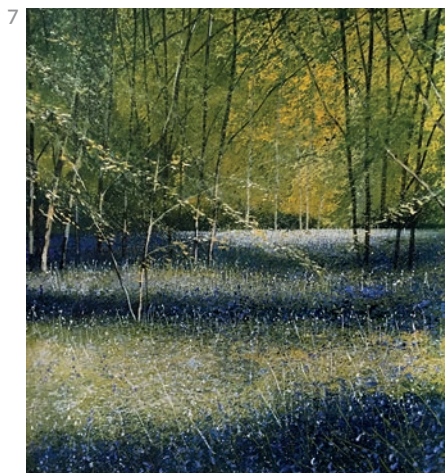
Swathes of light. Bluebell wood