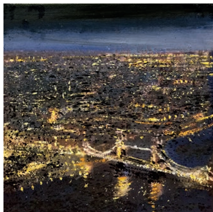
Tower Bridge from the Shard Mixed media 15 x 15cm