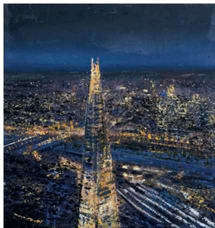
The Shard. Psalm 103 Mixed media 15 x 15cm