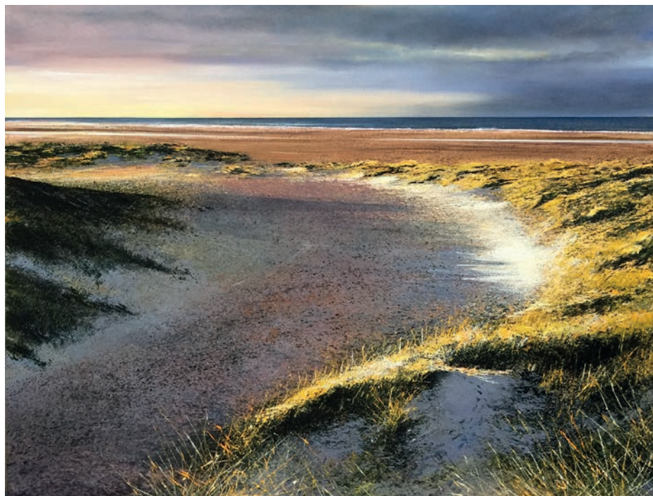
Back to the sea