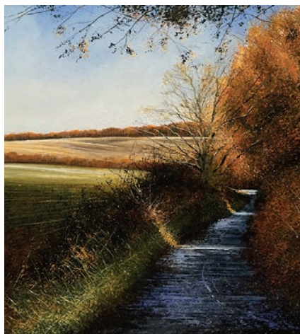
Autumn glory. Over to Luton Hoo